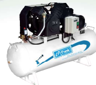
Oilfree Air Compressor 0.75 to 20 HP