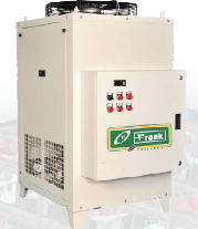
Refrigeration Chillers 0.5 to 50 TR