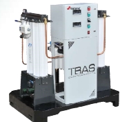
Medical Dryer 10 to 200 cfm