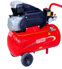
Direct Driven Compressor 2 HP