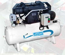
Vacuum Pump 1 to 10 HP