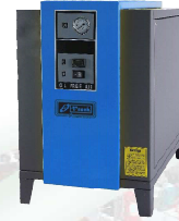
Oilfree Scroll Compressor 3 to 30 HP