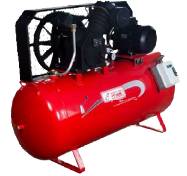
Belt Driven Compressor 1 to 30 HP